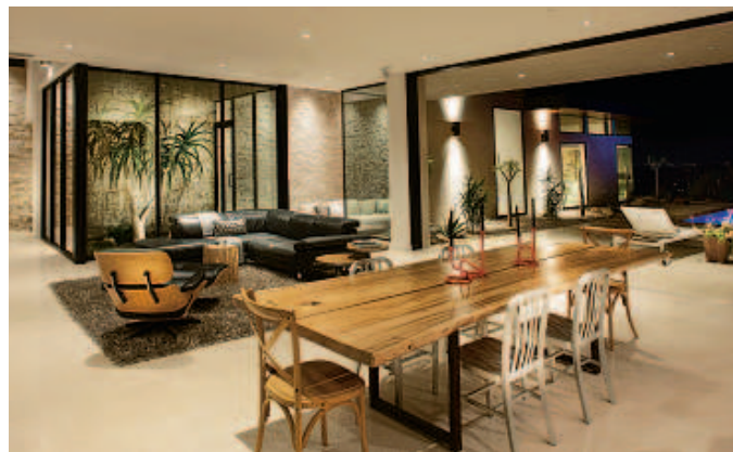
Twenty-foot retractable glass doors and continuous limestone tiles seamlessly integrate indoor and outdoor spaces. An atrium also helps bring the outside in.

Just past the steel pivot entry door, an atrium with a giant aloe