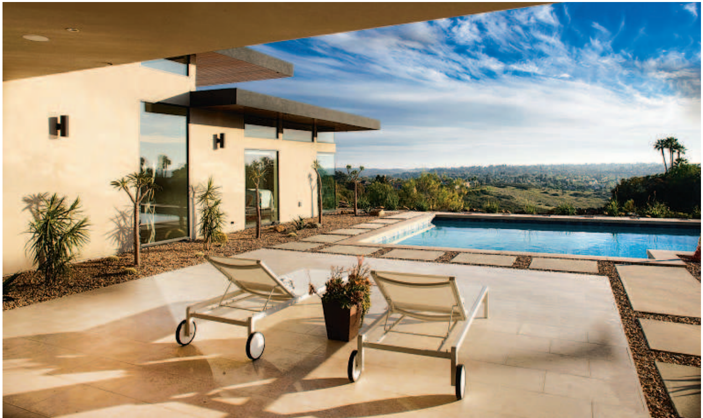
The home received gold LEED (Leadership in Energy & Environmental Design) certification by the U.S. Green Building Council and has solar heating for the pool as well as generous overhangs for passive cooling.