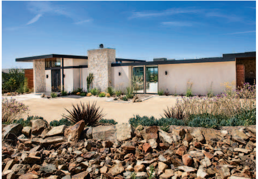
This four-bedroom, 4.5-bathroom 3,400-square-foot home in the Encinitas enclave of Olivenhain was built on a flat 1-acre lot. PAUL BODY

The concept started with a flat, empty one-acre lot overlooking designated open space and rolling